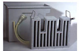
PATERSON AUTO PRINT WASHER 12 PRINTS - MAX SIZE - 24 x 30.5 cm