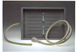
PATERSON HIGH SPEED WASHER